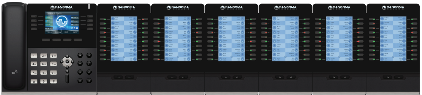
Daisy-chain Up to 6 Modules

The EXP100 is managed and provisioned by the Sangoma s500 and s700 IP Phones which means they can be auto-provisioned efficiently via Zero Touch Provisioning and the FreePBX / PBXact UC EndPoint Manager.