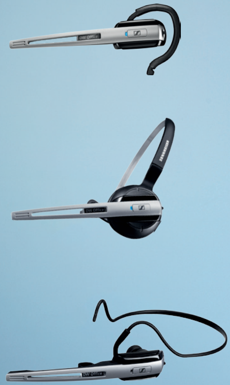
Note: Neckband available as accessory