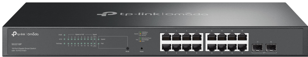
16 × Gigabit PoE+ RJ45 Ports 2 × Gigabit SFP Slots